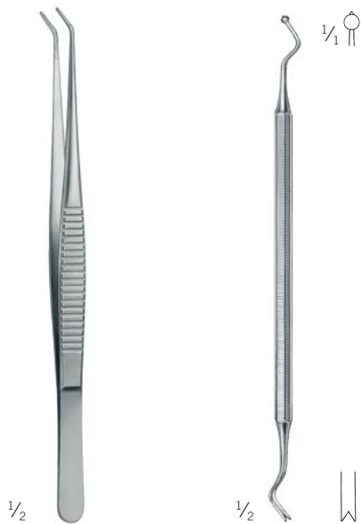
Plate-holding forceps, curved 51-525-80-07 15.5 cm

(For all distractors fixed with 1.0-mm screws)