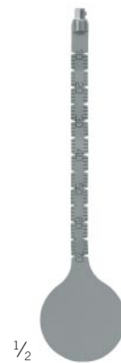
Activator measuring device