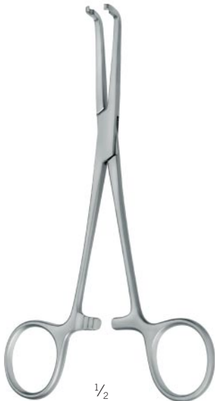
Body holding forceps