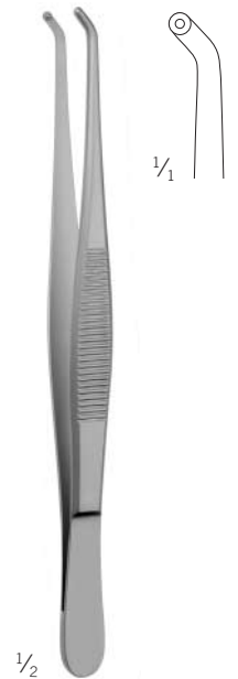
Activation arm disconnection forceps